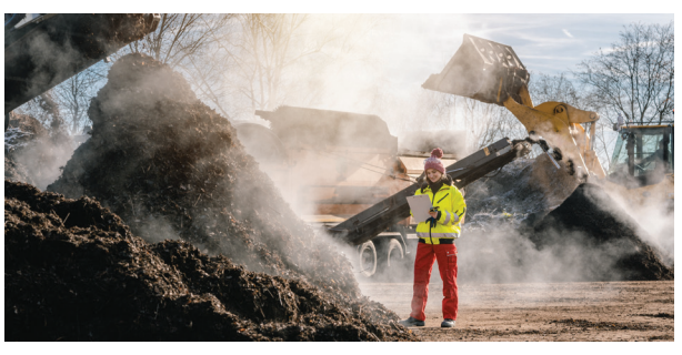
The material is placed in large piles, where microorganisms begin to break it down and heat up the piles to very high temperatures.