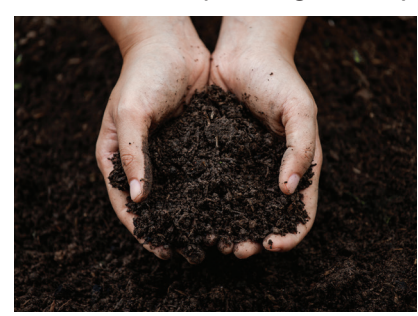
After about 12 months, the material breaks down and is transformed into an earthy, soil-like material called compost.