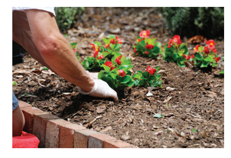
Compost is used to fertilize plants, gardens, and other outdoor areas.